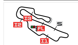
Autodromo Internazionale del Mugello 5245 m.

* Lap / Sector time cancelled P Crossing the finish line in pit lane ** Tyre data subject to further updates